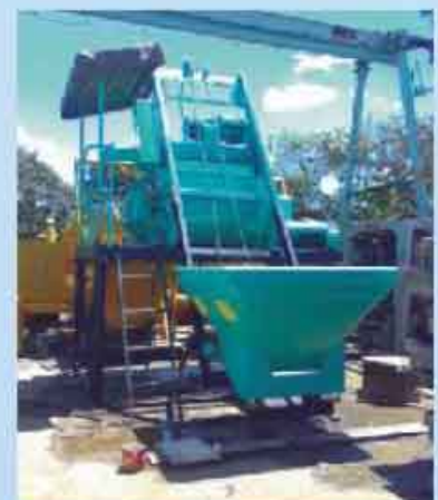
Mini Batching Plan, ( digital weighter ) Capacity 20 m3/hour