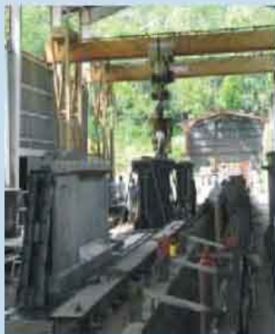
Surabaya - Madura Bridge, East Java Segmental PC I-girder, L40m-H 2,1m