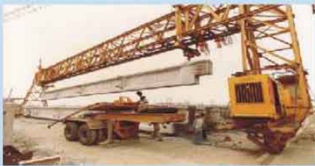
Boogie Trailer PC I-girder Fabrication