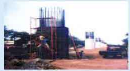
Fabrication Steel Form work Pier Head