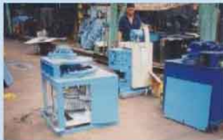
Bar Bender & Bar Cutter