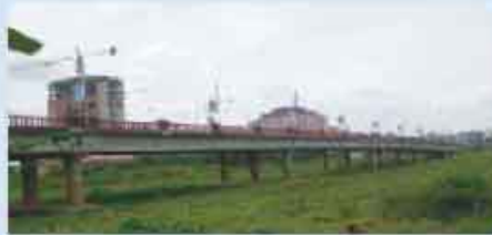
PC I-girder, 8 Spans 48 Nos, L 40m - H 2,10m