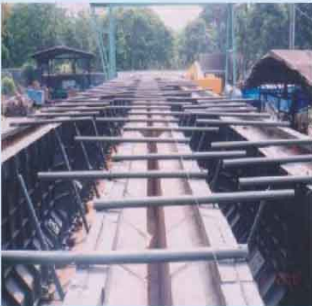
Workshop 1 Ds. Cikiwul, Pangkalan II Kec. Bantar Gebang - Bekasi