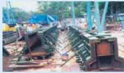
Fabrication Steel Form work & Repair JORR Jakarta Toll Road