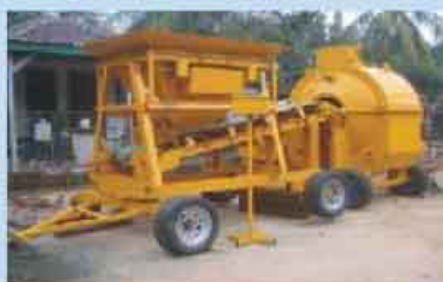
Mini Batching Plan, ( digital weighter ) Capacity 10 m3/hour