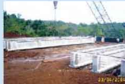
Kali Kuto Bridge, PC I-girder, 45 Nos, L40m Kali Kenceng Bridge, PC I-girder 7 Nos, 40m Kali Janis Bridge, PC I-girder 5 Nos, L40m Central Java