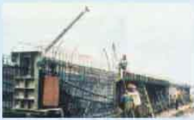
Fabrication Steel Form work Priok - Pluit Toll Road