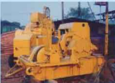
Diesel Power Winch