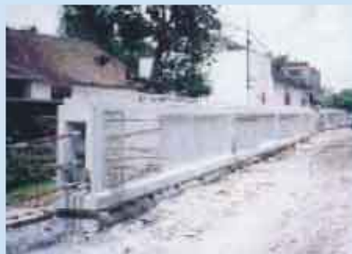
Package OP-02, Klaten - Kartasura PC I-girder, 24 Nos, L32m-35m H1,85m PC I-girder, 12 Nos, L26m H1,5m Central Java