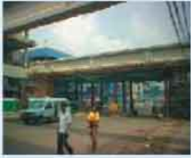
Kebon jati Tanah Abang Bridge - Jakarta