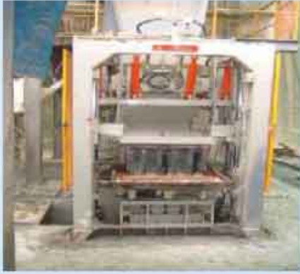
Block System Machine