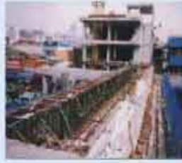
PC I-girder, 1 Spans 22 Nos, L 40m - H 1,85m ( under construction )