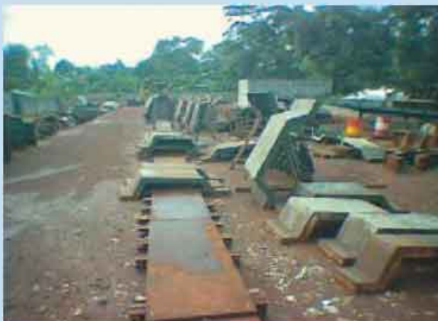
Workshop 2 Jl. Jankes No. 38 Munjul Cibubur - Jakarta Timur