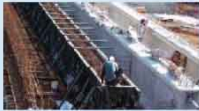
Sendawar I & II Bridge - East Kalimantan PC I-girder, 42 Nos, 2x3 spans, L40m-H 2,1m & L20m-H1,4m