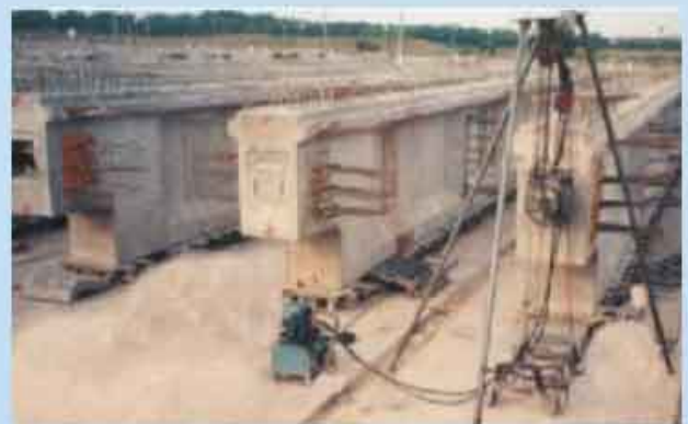
Fabrication Steel Form work Tanjung Priok - Pluit Toll Road - Jakarta