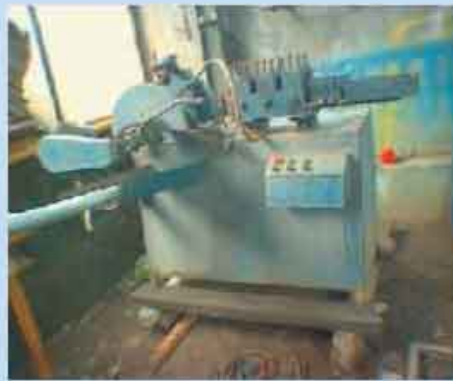
Galvanize Duct Machine PC. Girder supply ducting