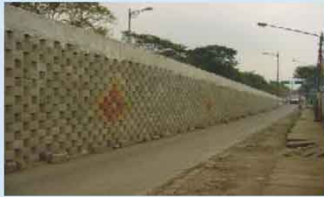
Retained Earth Pasupati Bridge - Bandung Supply concrete block system machine