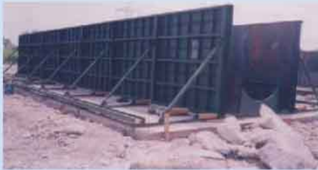
Concrete Cable Block