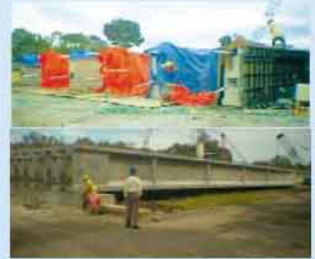
Surabaya - Madura Bridge (Madura side) PC I-girder, L40m- H2,1m ( under construction 416 Nos )