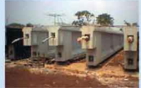
Waru - Juanda Toll Road - Surabaya PC I-girder, L30m-35m H1,85m PC I-girder, L20m-25m H1,40m ( under construction 284 Nos )