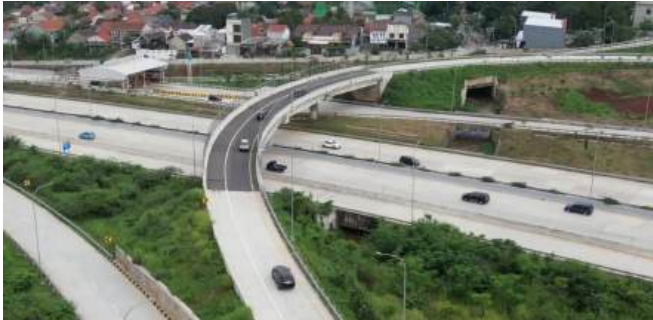
Krukut Bridge (Ramp 8) Section 1 South