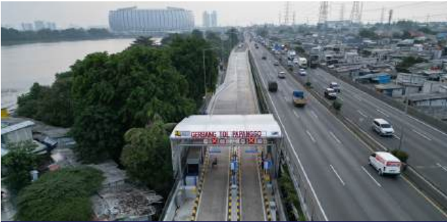
ON OFF Ramp Construction (Ramp 3 & Ramp 4) North Papanggo