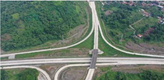
Cisumdawu Toll Road Project Section 3