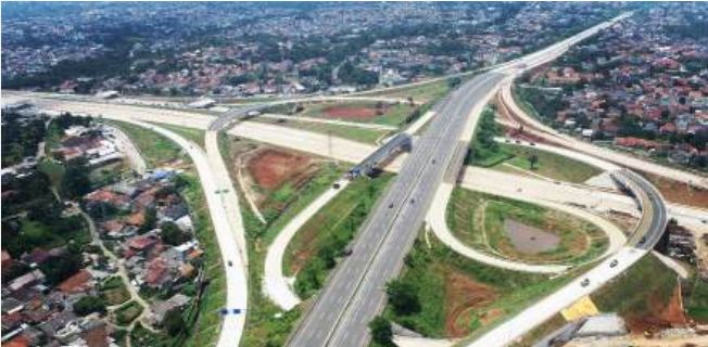
Depok – Antasari Toll Road Package 1 South