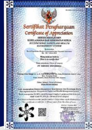
SMK3 CERTIFICATE — MINISTRY OF MANPOWER