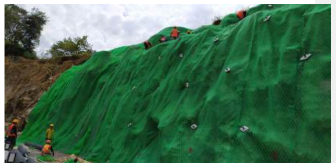
Rampa – Poriaha Mungkur Slope Stabilization (WINRIP)