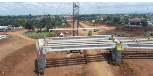
Girder Supply and Installation Depok Antasari Toll Road Package 1, Brigif Section