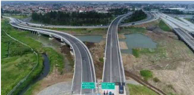
Soreang – Pasir Koja Toll Road Project