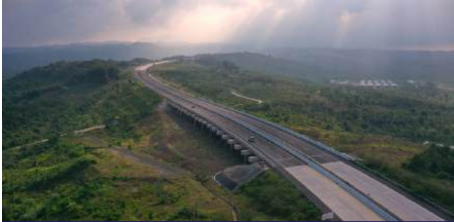
Cisumdawu Toll Road Project Section 5B