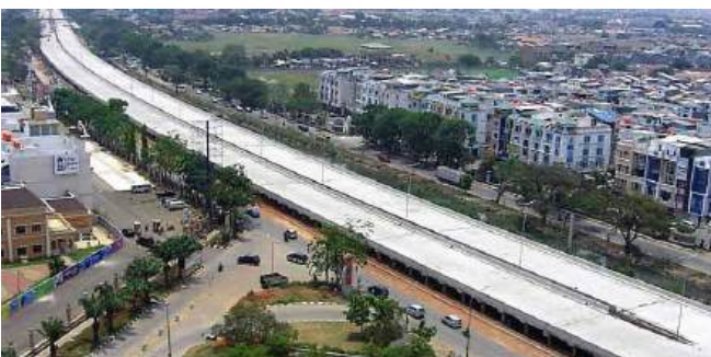
JORR W1 Toll Road Package 6 and 7