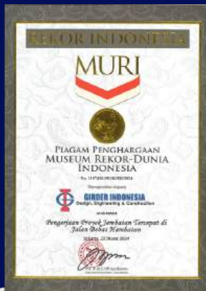
MURI RECORD AWARD