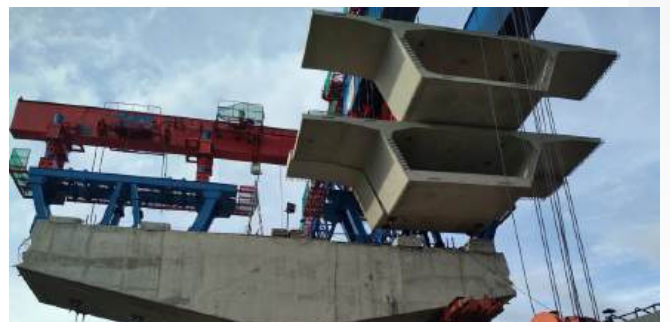
Bogor Ring Road Toll Road Section IIIA