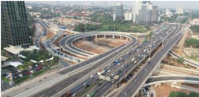
Depok – Antasari Toll Road Package 1 North