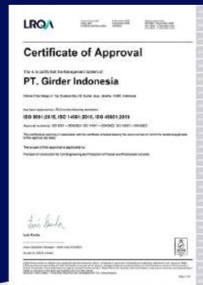
LRQA ISO CERTIFICATIONS