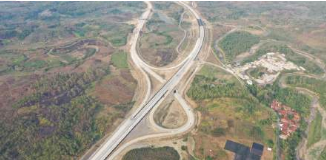
Cisumdawu Toll Road Project Section 6A