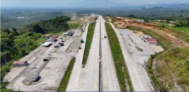
Rest Area Development Cisumdawu Toll Road