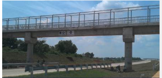
Cipali Toll Road Bridge Project