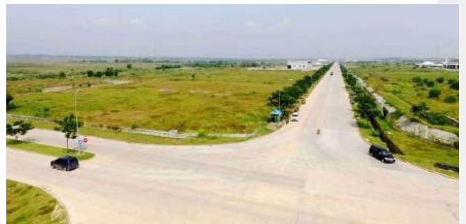
Deltamas Area Road & Drainage Project