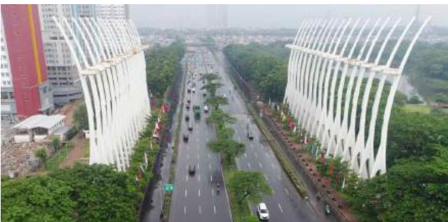
Kemayoran Toll Road Widening Project